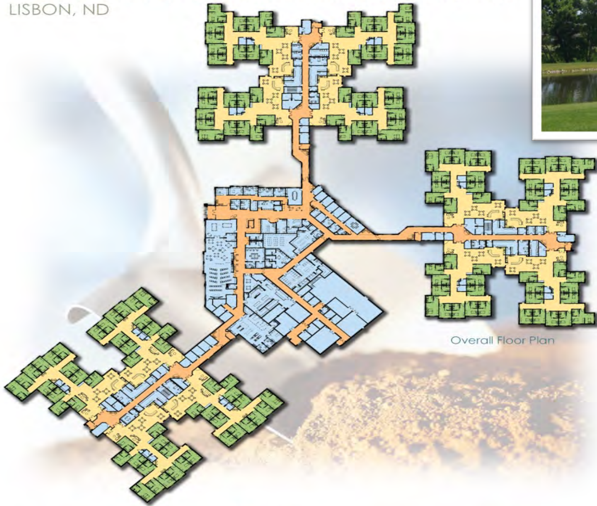
Overall Floor Plan