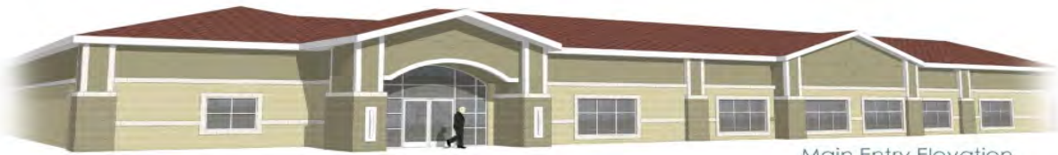
Main Entry Elevation