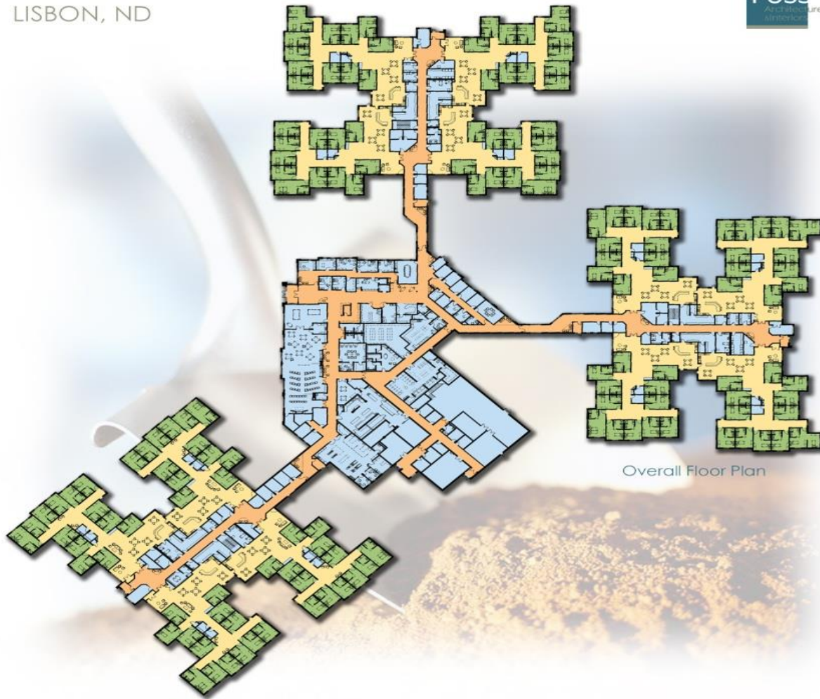
Overall Floor Plan