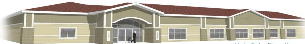
Main Entry Elevation